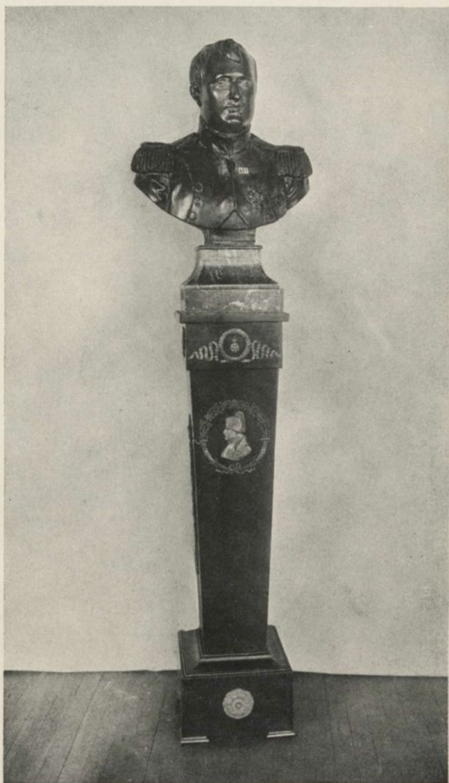
No. 165. BRONZE BUST " 312. MAHOGANY PEDESTAL